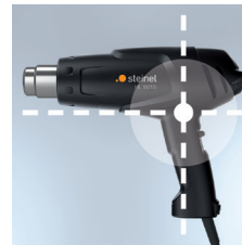
Optimised weight balance