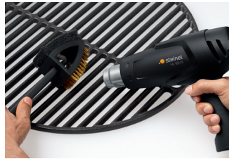
Clean barbecue grills