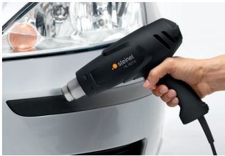
Freshen up plastic